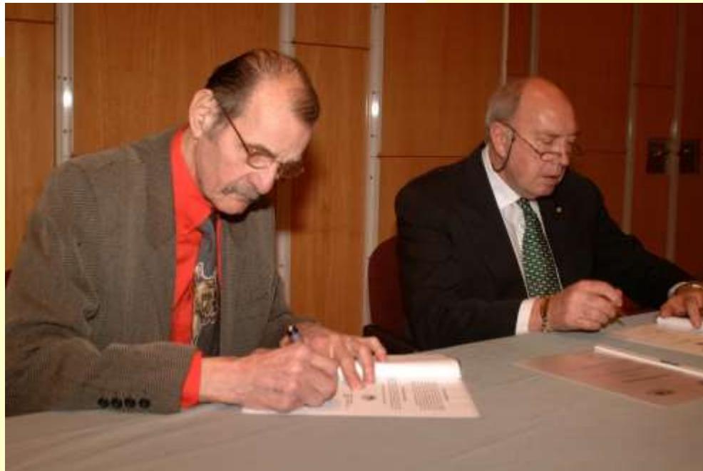
Signing the Partnership Contract with FCI in Kamen, Germany, 2005